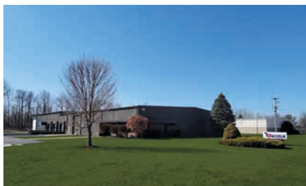
Brianza USA Corporation - Elkhart (Indiana), USA - Commercial site.