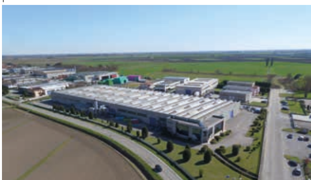
Brianza Plastica - San Martino di Venezze, Italy - Production site 1.