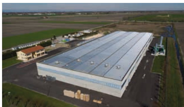
Brianza Plastica - San Martino di Venezze, Italy - Production site 2.