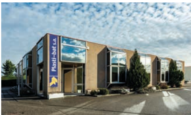
Plasti-Bat - Diemoz, France - Commercial and logistic site.