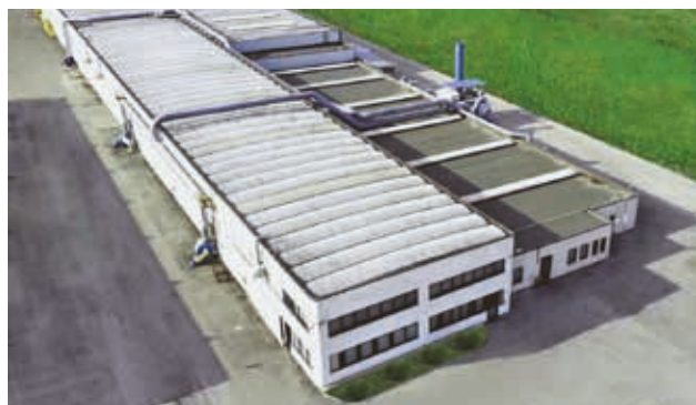
Brianza Plastica - Ostellato, Italy - Production site.