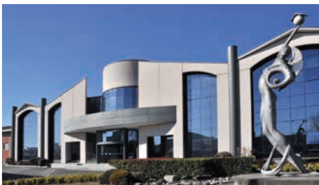
Brianza Plastica - Carate Brianza, Italy - Headquarters and production site.

At the beginning of 2019 , the new chemical laboratory was inaugurated, almost tripling the previous surface area and significantly improving the equipment used to carry out most of the chemical-physical tests, on both raw materials and finished products.